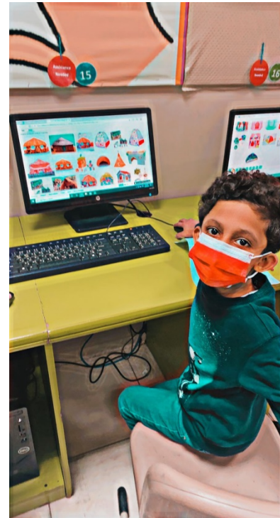
Students do research on houses now and then!

Students provided with resources (pictures) of new social media programs, they were asked to (Make connections) How is your building that you have chosen is different or similar to nowadays building? experencing the remote learing at the beginning of this year in many ways as oral discussion or written in Nearpod and ClassDojo.